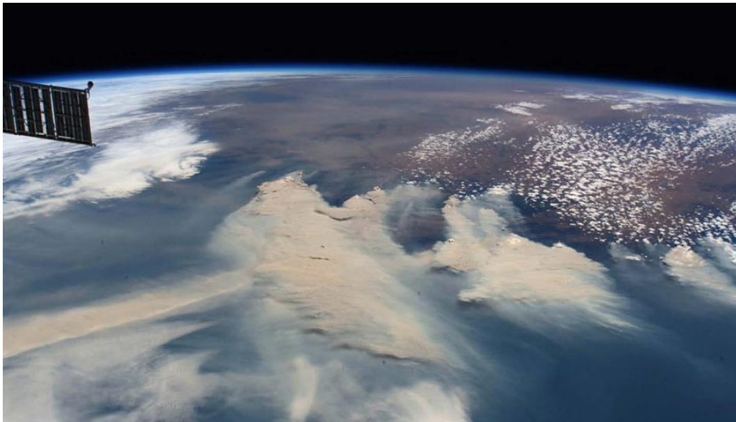
View of the smoke clouds extending over the Pacific Ocean, taken from the International Space Station ISS (photograph: iss061e120235)