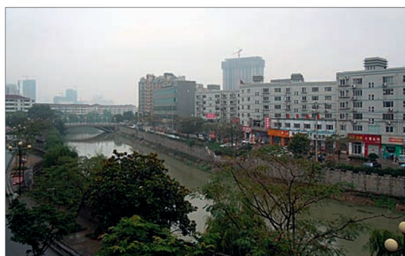
6. View of Suqian.

Suqian has committed itself to sustainable development and green initiatives, including the establishment of over 800 square kilometres of forest coverage and the adoption of renewable energy sources, meeting 30% of its energy needs. Urban planning efforts have already resulted in a reduction in pollution levels and an increase in green spaces.