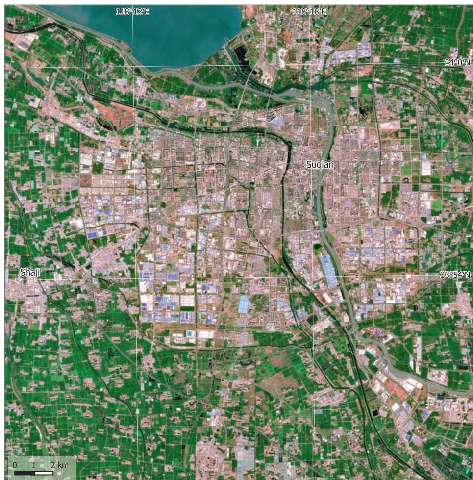
9. Suqian, China, in 2023. Data: Sentinel-2, 2023-04-16.