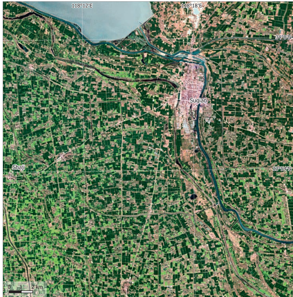
8. Suqian, China, in 1987. Data: Landsat 4, 1987-04-21.