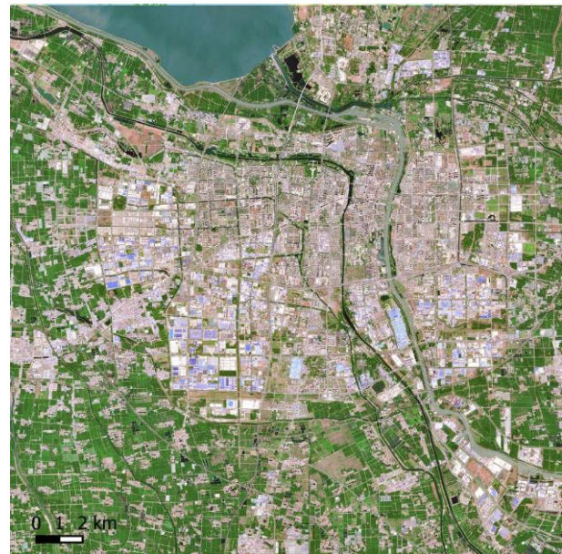
Suqian, 2023 (Sentinel-2)