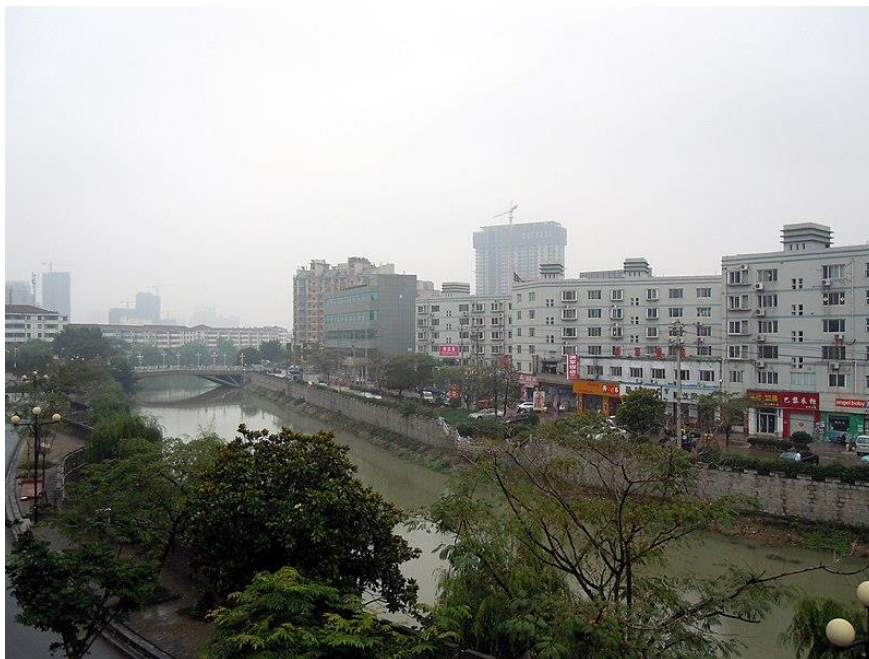
View of Suqian.