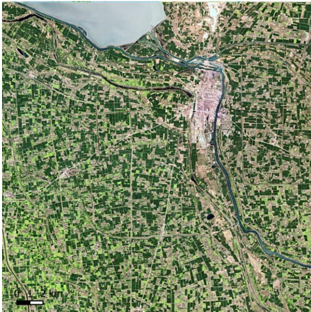
Suqian, 1987 (Landsat 5)